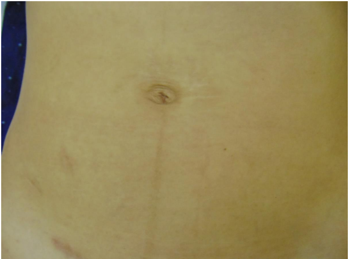
Case 2. Endymed 3 sessions 6 th level.